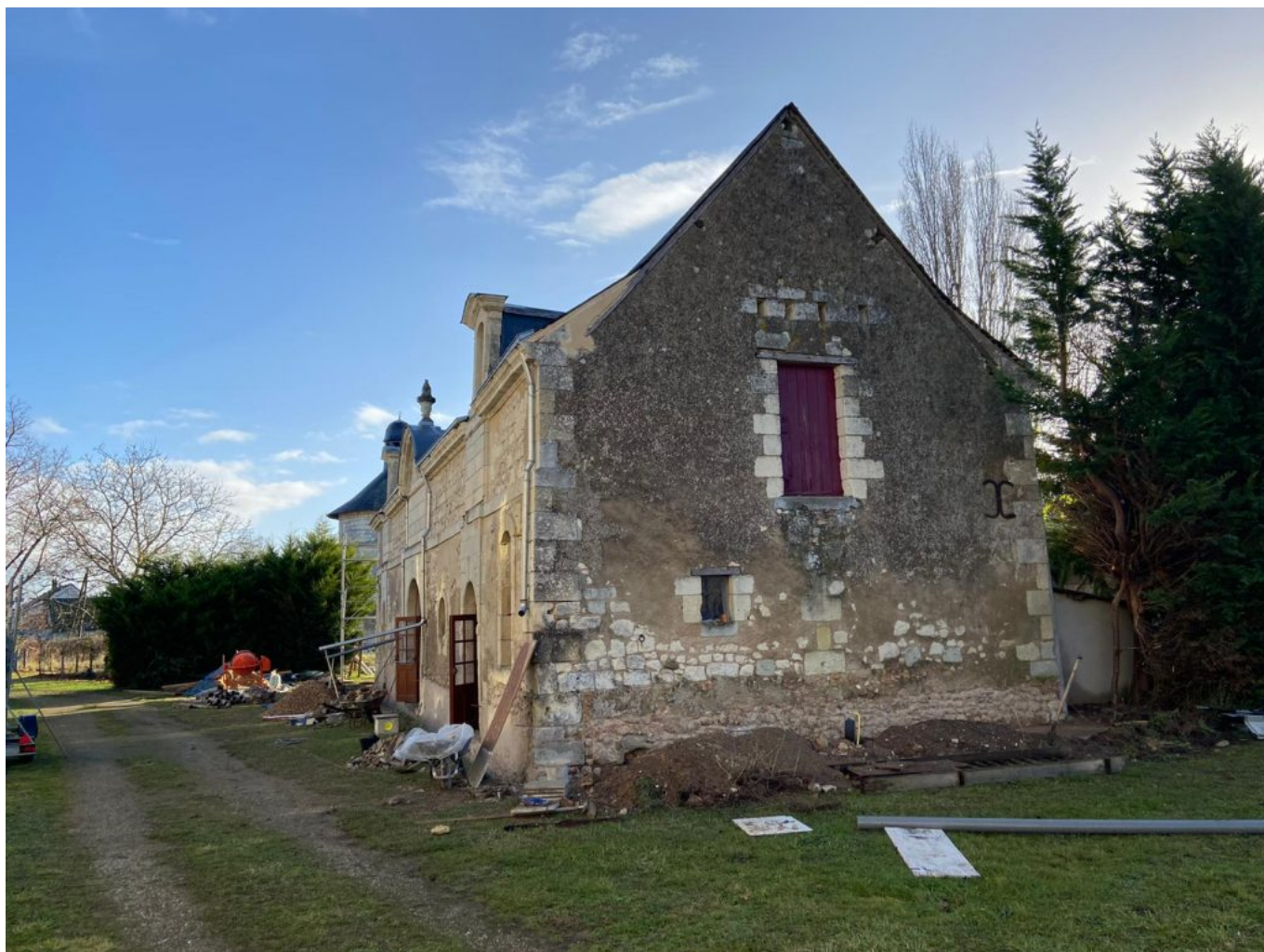
Another view of the Longère.