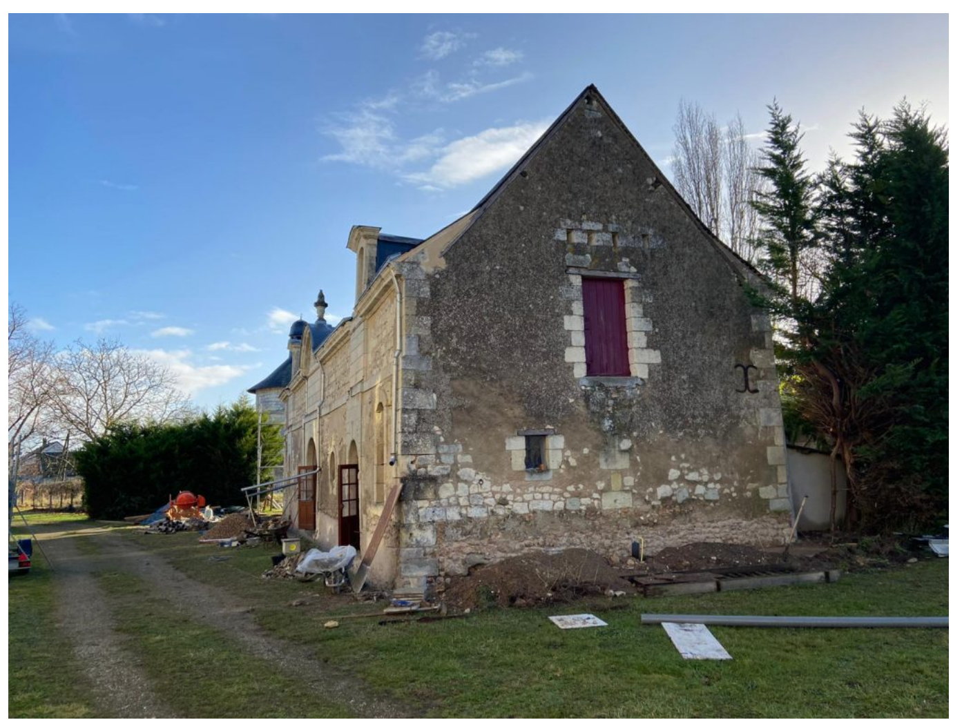
Another view of the Longére.