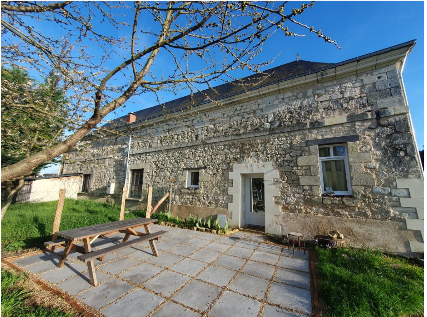
The back door of the apartment, facing east. Sacred syllables A, OM, HUNG, RAM, DZA are carved above it.

Individual retreats with skygazing? Will be possible