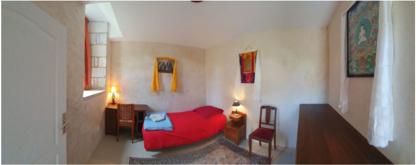
The smaller room