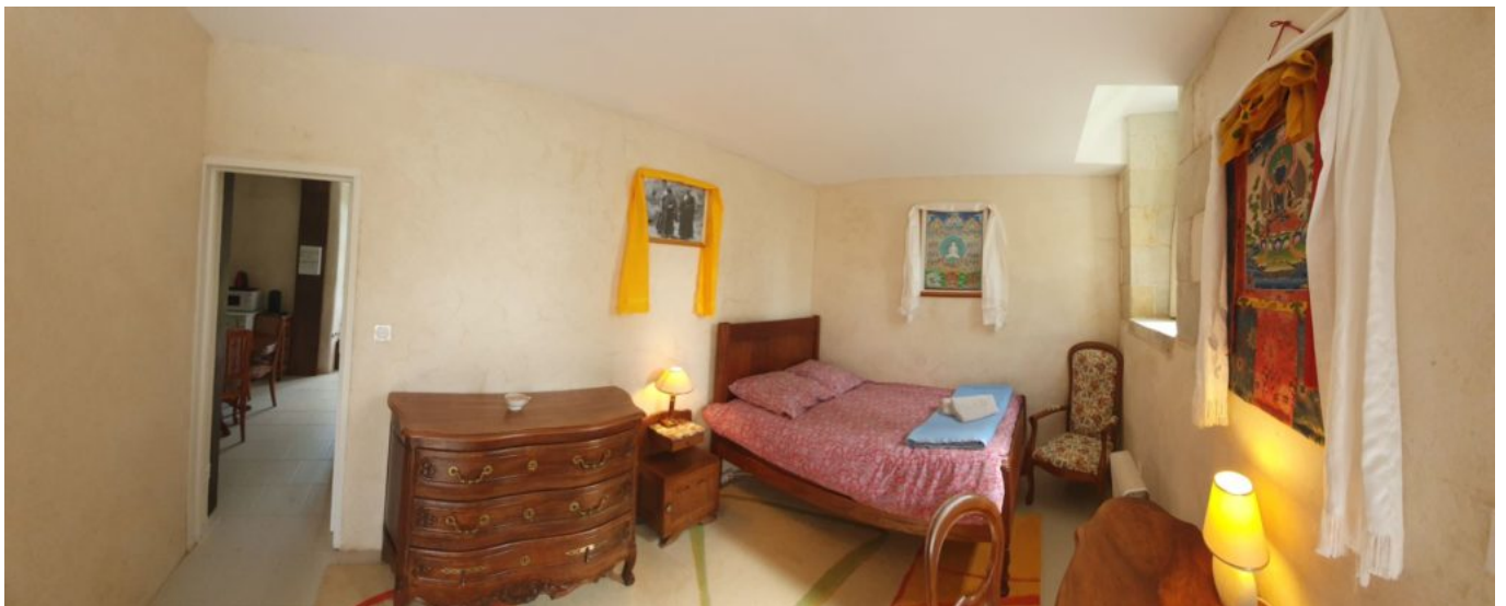
The bigger room