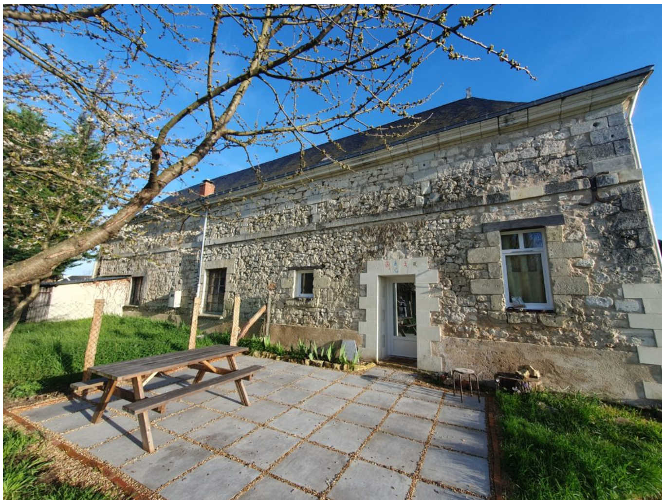
The back door of the apartment, facing east. Sacred syllables A, OM, HUNG, RAM, DZA are carved above it.

Individual retreats with skygazing? Will be possible